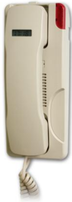
41 Series T5 1-Line Phone with LCD Clock (A41-1T5MK)