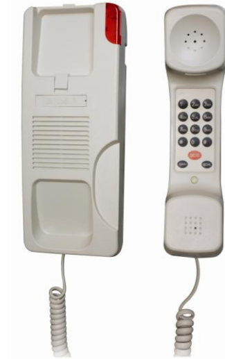
41 Series T5 1-Line Phone with Membrane Keypad (A41-1T5M)