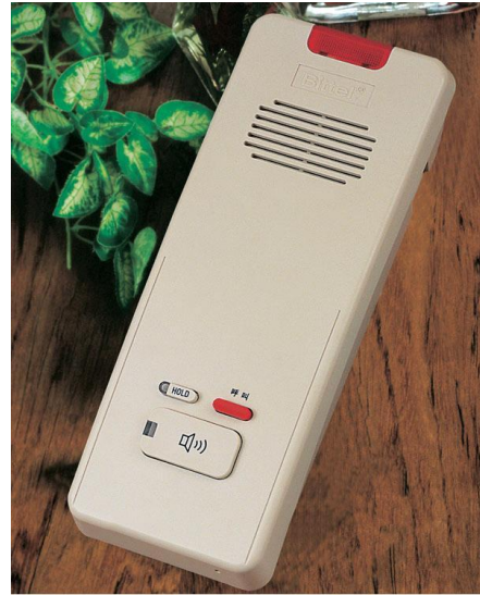
41 Series T-0 1-Line Phone with No Keypad (A41-1T0)