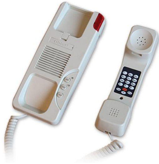
41 Series T-T 2-Line Phone with Membrane Keypad (A41-2T5M)