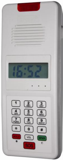
41 Series T-0 1-Line Phone with LCD Clock (A41-1T0MK)