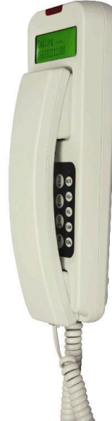
41 Series T-6 SIP (IP) Caller Display and Clock Phone (IP41-1T6DM)