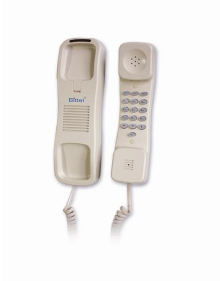
41Series T-18 1-Line Phone (A41-1T18)