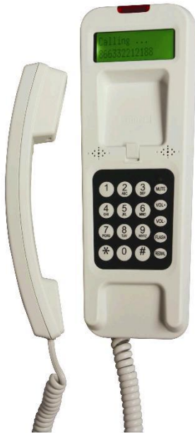
41 Series T-6 SIP (IP) Caller Display and Clock Phone (IP41-1T6DM)