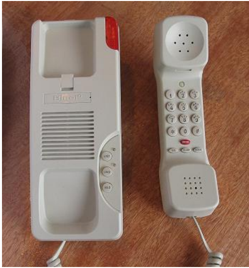
41Series T-T 2-Line Phone with standard keypad (A41-2T5)